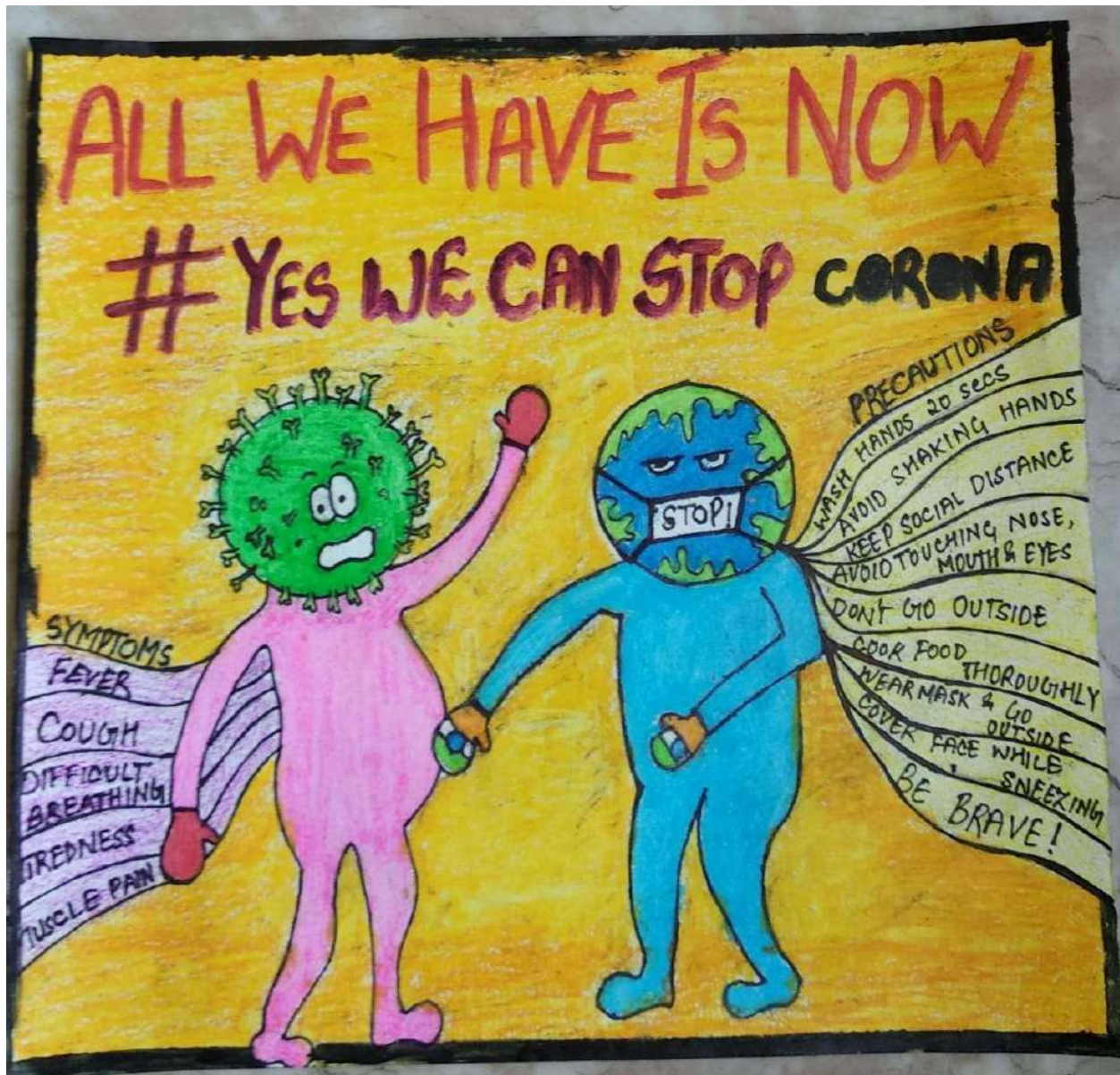
Sakshi Singh 9B